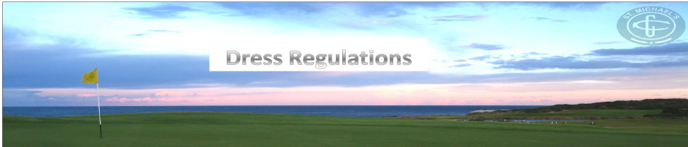
shirt tucked in